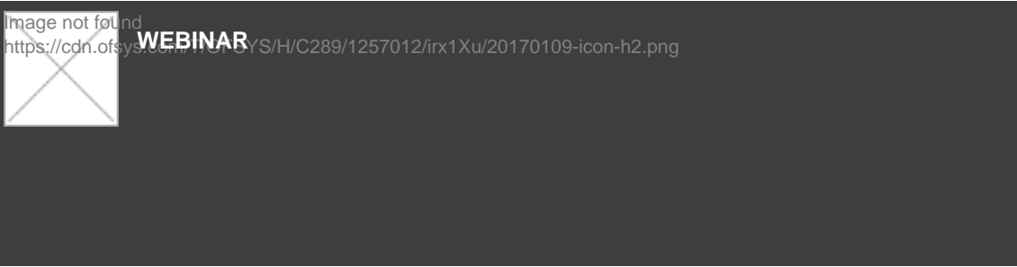
Image not found https://cdn.ofsys.com/FILES/H/C289/1257012/irx1Xu/20170109-icon-h2.png